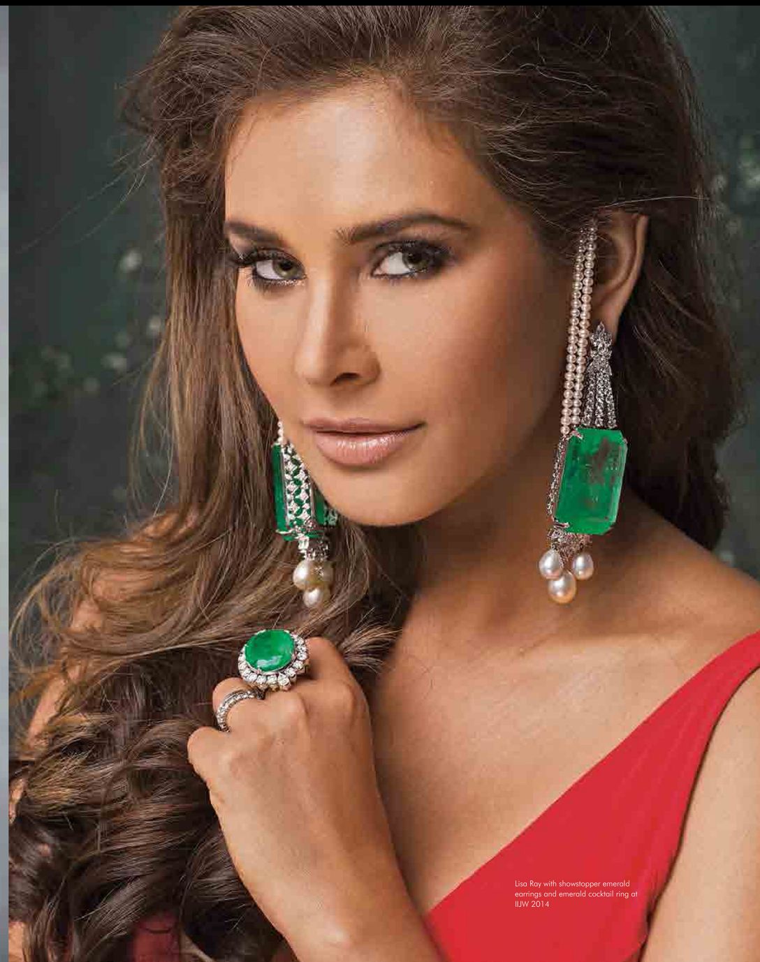
Lisa Ray with showstopper emerald earrings and emerald cocktail ring at IIJW 2014