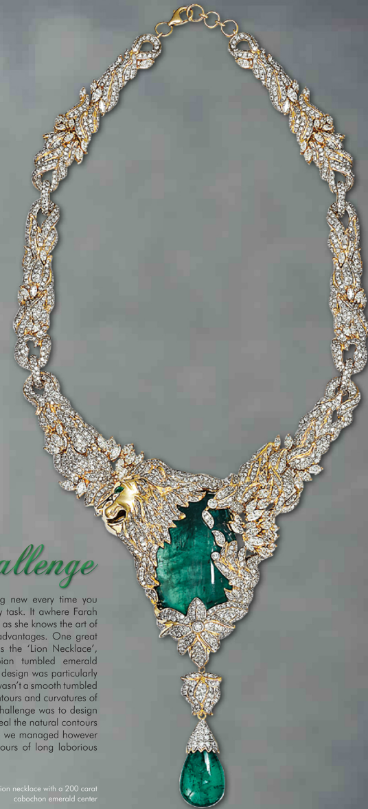
The Lion necklace with a 200 carat cabochon emerald center

Striving to make something new every time you sit to design is not an easy task. It is where Farah excels over other designers, as she knows the art of converting challenges into advantages. One great example of her creativity is the 'Lion Necklace', where a 200 cts. Zambian tumbled emerald forms the centerpiece. This design was particularly difficult, because the stone wasn't a smooth tumbled emerald and had many contours and curvatures of a natural form on it. The challenge was to design in such a way so as to conceal the natural contours of this large emerald which we managed however this necklace took many hours of long laborious craftsmanship to finish.