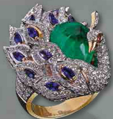
Peacock cocktail ring with cabochon emerald center

When in an experimental mood, Farah loves to combine emeralds with other coloured gemstones to create stunning effects like emeralds with Blue Sapphires, Tanzanites, Rubies, Chrysoprase, Turquoise, Pearl, Coral, Aquamarine and many more. Simplistic yet spellbinding; these combinations have been a sure shot hit!