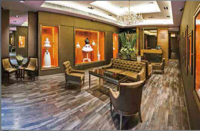
Farah Mumbai boutique interiors